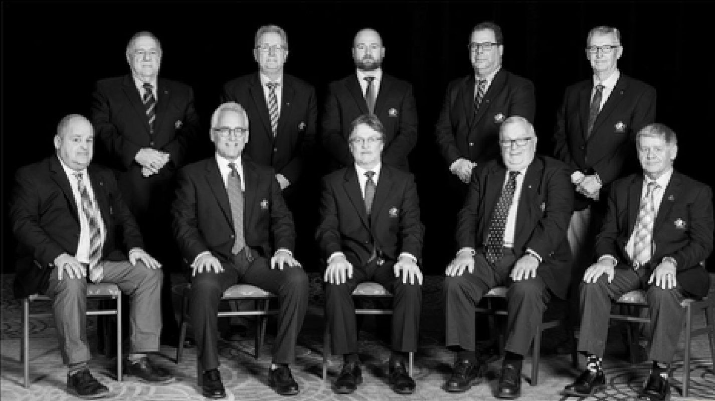
Figure 1 Hockey Canada's 2019 Board of Directors

We recommend instituting hiring policies that prioritize Indigenous and racialized candidates once all job requirements are met. We also recommend hiring policies designed to prevent nepotism, including blind review processes. In the case of officials, we recommend Hockey Canada provide resources and training to provincial referee associations with the specific mandate to increase the participation of Indigenous, racialized, and women officials at all levels.